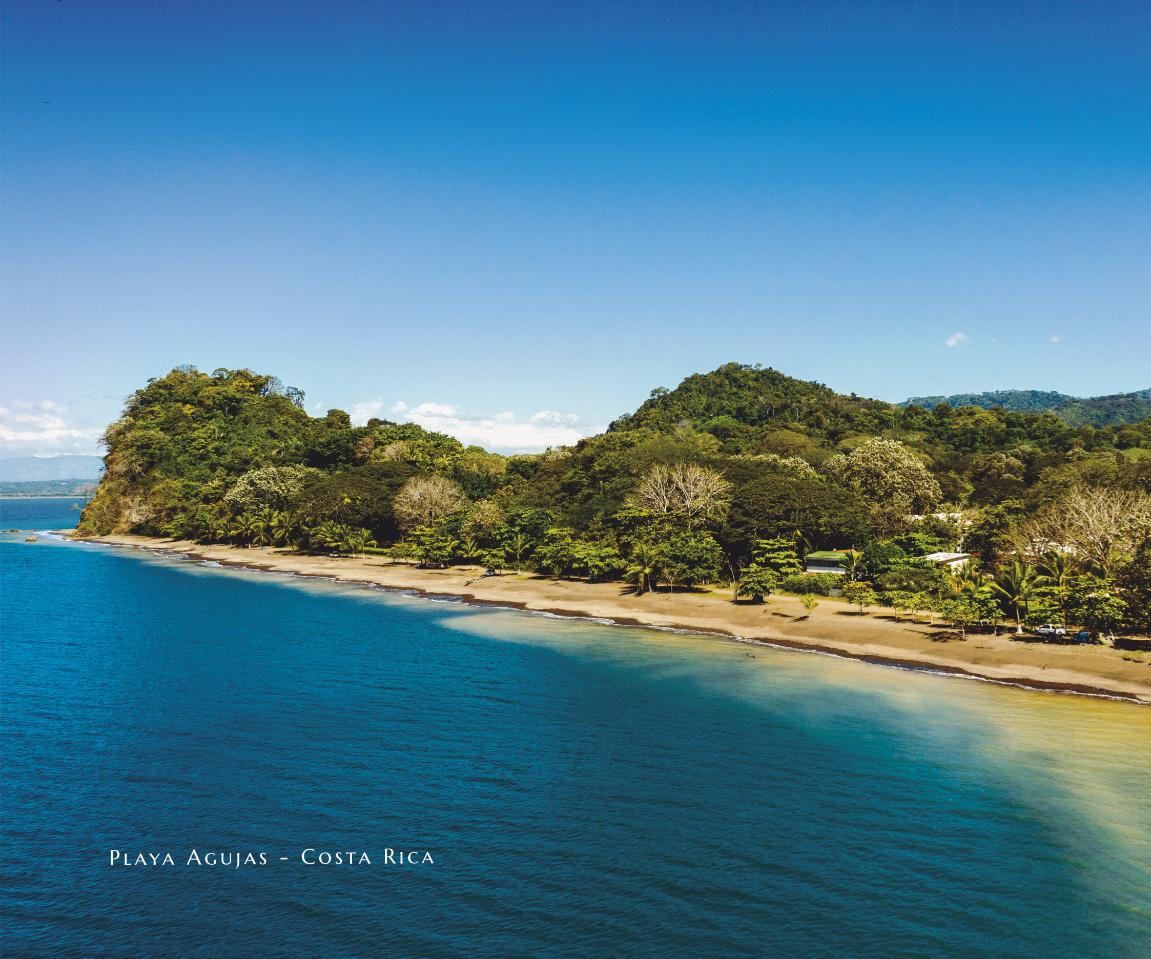
PLAYA AGUJAS - COSTA RICA